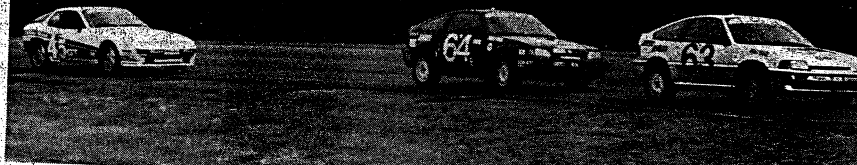
The race finished much better than it started for Team Honda.